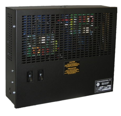
LDP-4K 4,000 Watt Auxiliary Dimmer Cabinet

instructions for converting a 2,000 watt unit into a 4,000 watt unit