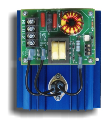
Dimmer Power Module