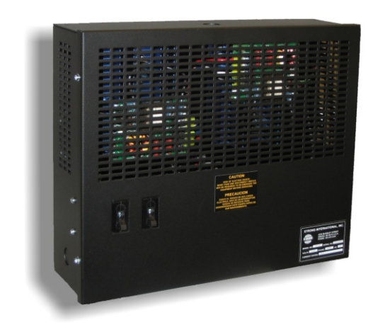
AP-4K 4,000 Watt Auxiliary Dimmer Cabinet

Auxiliary dimmer cabinets are used where it is desirable to fully utilize unused/ underused channels of an existing controller. This controller may be a QDC-400 inside your CNA automation, a 37627, or a wall mounted dimmer with unused control outputs.